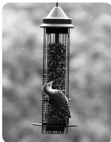
Our Fundamentals Squirrel-proof Feeder