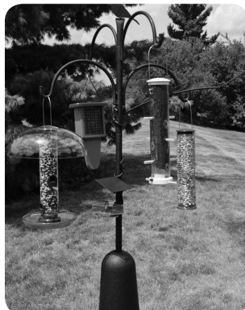
A Pole Baffle is a Great Squirrel Deterrent

The Eliminator™ and Fundamentals Squirrel-proof Feeders are weight-sensitive and will close off access to the food when heavier visitors sit on a perch.